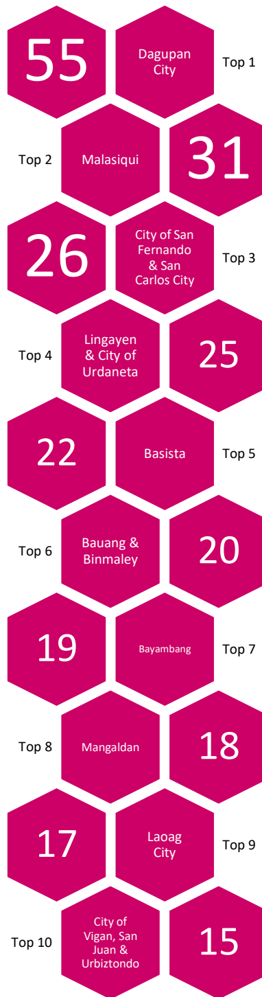
Figure 3. Top Ten Cities/Municipalities with the Highest Number of Registered Marriages, Ilocos Region: July 2020