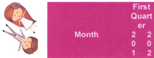
Figure 2. Daily Average Number of Registered Marriages by Month Ilocos Region: 1 st Quarter 2019 and 1 st Quarter 2020