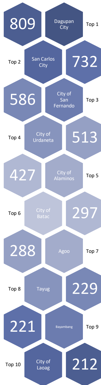
Figure 1. Top Ten Cities/Municipalities with the Highest Number of Registered Live Births, Ilocos Region: December 2020